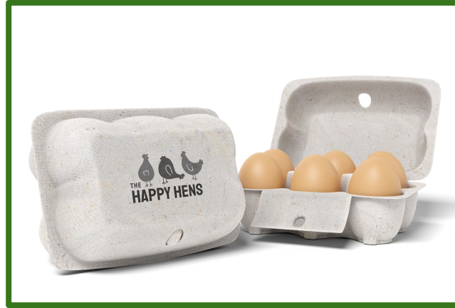
★ egg cartons