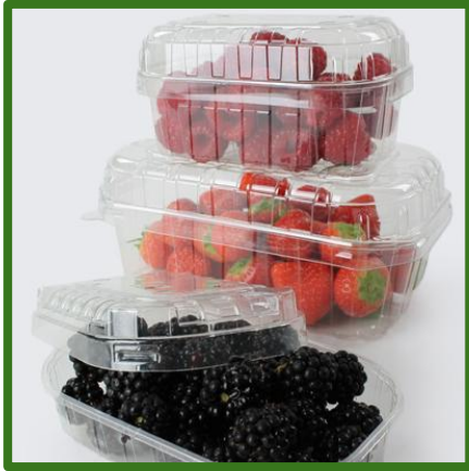
★ plastic punnets