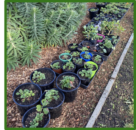
★ plastic pots